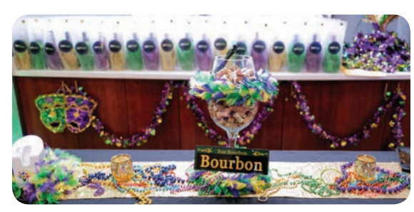
This was the first year that we introduced the Wine Pull sponsored by Riverworks Marketing . Attendees had the chance to grab a cork for one of the many bottles of wine that were graciously donated for this event.

At the end of the night, all attendees were offered complimentary Uber rides, courtesy of our Safe Ride Sponsor, Best & Brock . Because of the support of our 2024 Mardi Gras Gala, a record of nearly $132,000 was raised to benefit Chambliss Center for Children's programs!