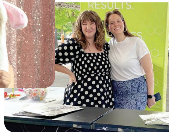
We are so thankful for the support of our Presenting Bunny Seed Biotech .