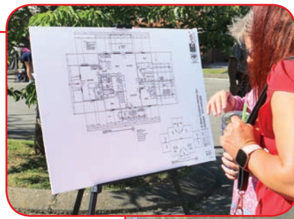
Visitors were excited to see floor plans for the new house at Chambliss Center for Children before the event.