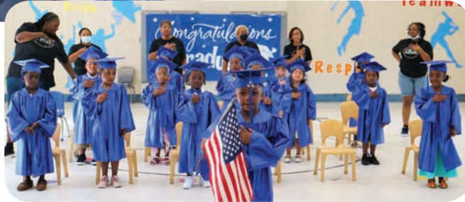
The ceremony began with the graduating class leading the Pledge of Allegiance.