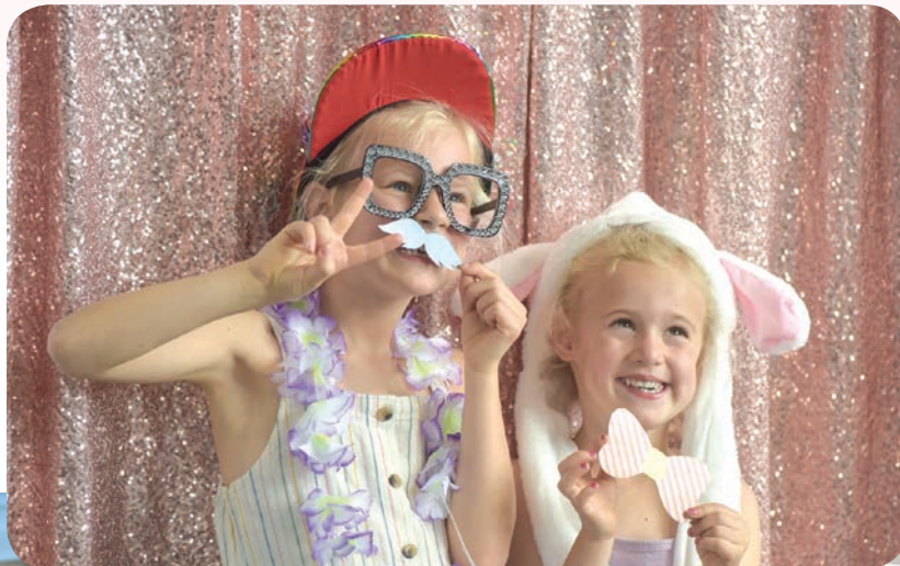
These sweet sisters enjoyed posing with silly props from our photo booth.